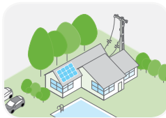
Residential grid-tie solar with backup power